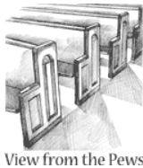
View from the Pews

We all know about the pew pads, and we all have our own opinion of them.